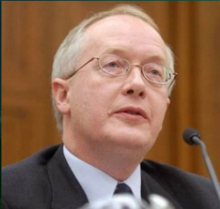
Myron Ebell Competitive Enterprise Institute