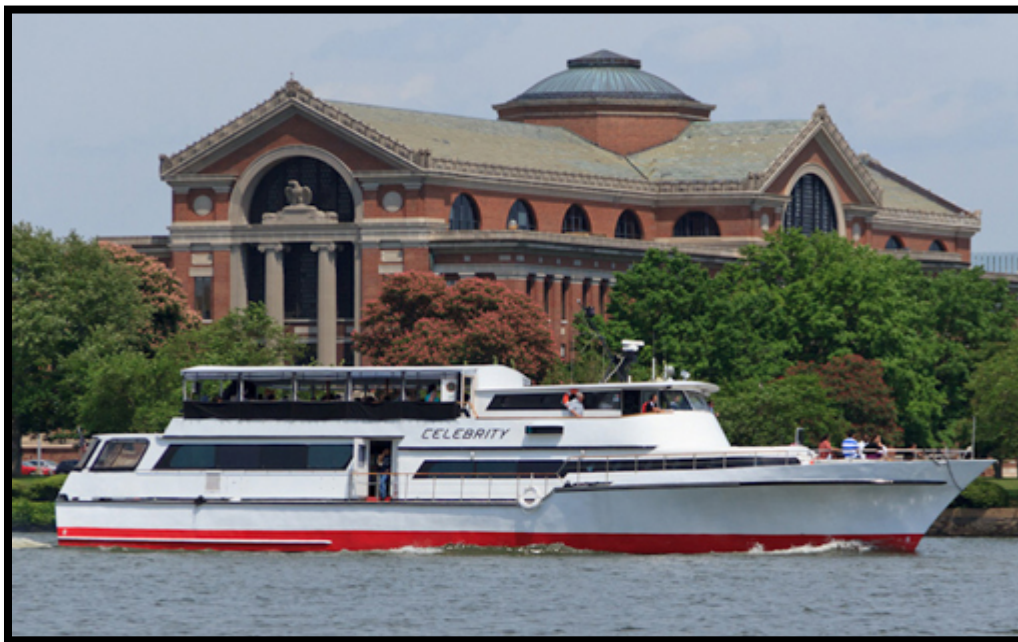
Photo of Celebrity , the second largest yacht in the Capitol Yacht Charters fleet.